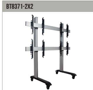
BT8371-2X2 Universal Mobile Video Wall Stand for 2x2 Video Walls