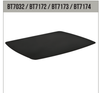
BT7032 / BT7172 / BT7173 / BT7174 AV Accessory Shelves can be attached directly to a vertical column