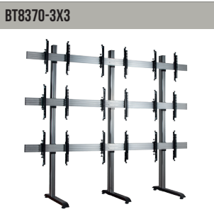
BT8370-3X3 Universal Video Wall Stand for 3x3 Video Walls