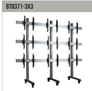
BT8371-3X3 Universal Mobile Video Wall Stand for 3x3 Video Walls