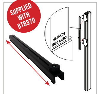
Screen spacer designed to eliminate calculations and guess work when installing horizontal rails